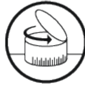
Ballistic Drop Compensation (optional)