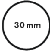
Main tube 30 mm