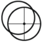
2nd focal plane