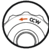
Adjustment direction CCW